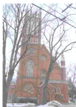
5 Henry Street

In addition to housing our Therapeutic Support Day Program we will be asking stakeholders to engage in discussions concerning the optimal use of the expanded space. ■